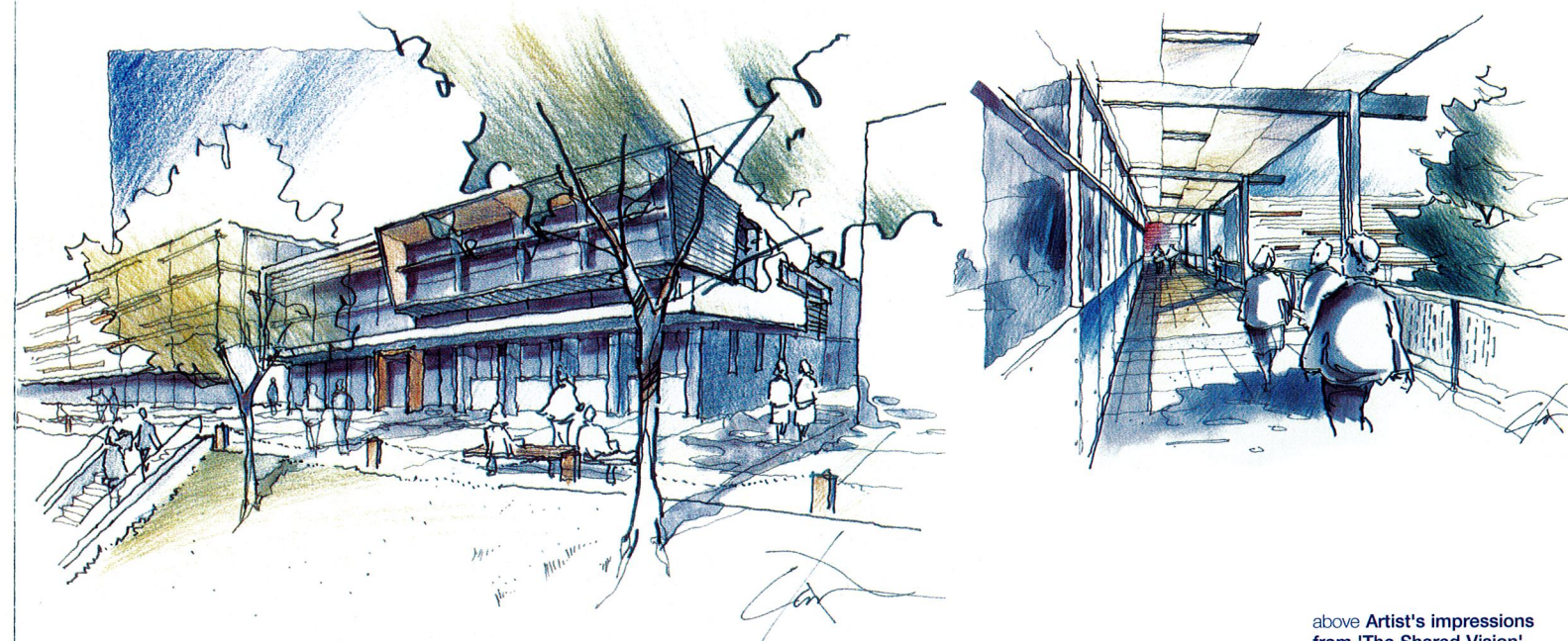
above Artist's impressions from 'The Shared Vision'.