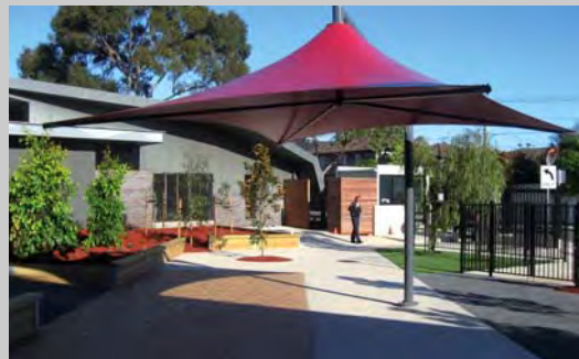
Alter Family Plaza

New Smorgon Family Primary School at Gandel Campus.