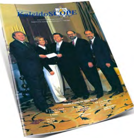
KaleidoSCOPE July 1994