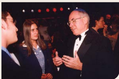
Foundation Jubilee Dinner with guest of honour, Prime Minister John Howard