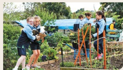
A focused appeal, generously supported by the College's major benefactors, provided the ability to minimise fee increases and to offer additional bursaries