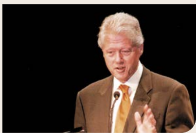
School visit and Foundation Gala Dinner with President Bill Clinton