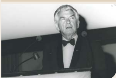
Mount Scopus College Foundation launched by Prime Minister Bob Hawke