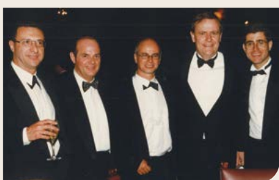
'5 year - $ 8,000,000' Capital Campaign launched by Federal Treasurer Peter Costello